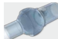
...unrestricted freedom of movement